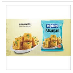
Khaman Mix Powder