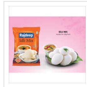
Idli Mix Powder