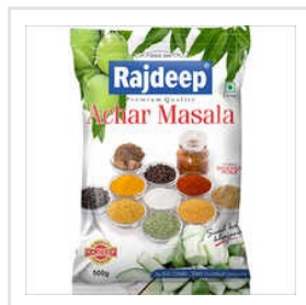
500 G Achar Masala