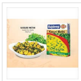
Kasuri Methi Powder