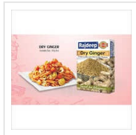
Dry Ginger Powder