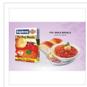
Pav Bhaji Masala