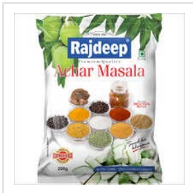
Rajdeep 200 G Achar Masala