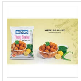
Moong Bhajiya Mix Powder