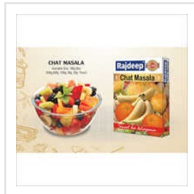
500 G Fruit Masala