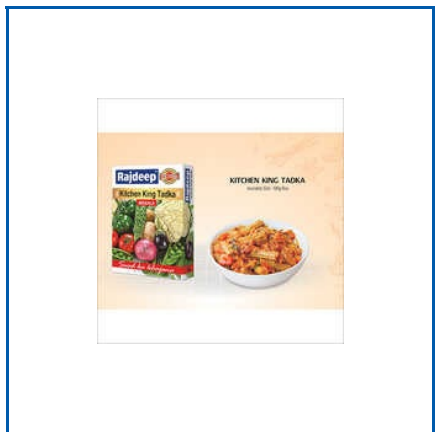
KITCHEN KING TADKA MASALA