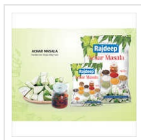
Pure Achar Masala