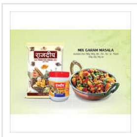
Red Chilli Powder