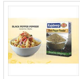
Black Pepper Powder