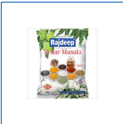
RAJDEEP 200 G ACHAR MASALA

200 g Red Chilli Powder, 200g Gulab Jamun Mix, 400g Gulab Jamun Mix, 50 g Red Chilli Powder, 500 g Achar Masala, 500 g Fruit Masala, 500g Jaljeera Masala, Amchur Powder, Black Pepper Powder, Chana Masala, Coriander Powder, Dry Ginger Powder, Ghatti 50g Garam Masala, Ghatti Dhaniya Powder, Ghatti Haldi Powder, etc.